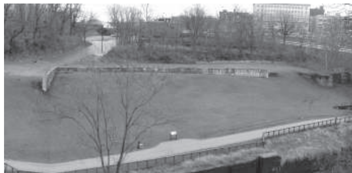
View of the Beech Street Power Plant site and trailhead. The Towpath Trail will continue south, to the right in the photo.

take a connector trail through the footprint of the building, down to the Towpath Trail. The City of Akron is heading up the project to design this site, working with CLPA and Metro Parks, Serving Summit County with consultant Burgess and Niple.