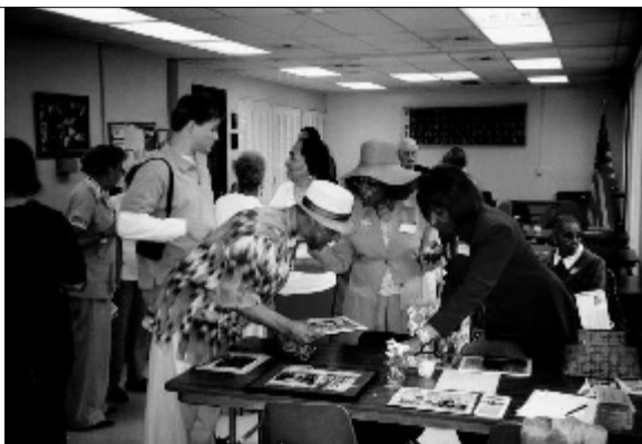
Attendees of our Howard Street "Reception to Remember" share some memories